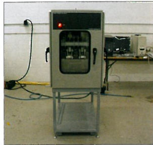
APA Jr. 型车辙仪 Asphalt Pavement Analyzer-Junior