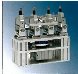
CRT-SA4PT-BFAT型 小梁疲劳试验机 CRT-SA4PT-BFAT Beam Fatigue