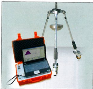
SEH-FBT型 落球式岩土力学特性测试仪 SEH-FBT Falling Ball Tester