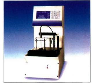
40100型 自动沥青软化点仪 40100 Automatic Asphalt Softening Point