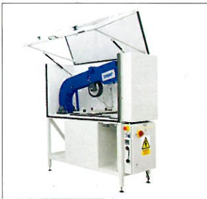
CRT-WTECO-A型 经济型加载臂自动提升车辙仪 CRT-WTECO-A The Auto Lift Arm ECO Wheel Tracker