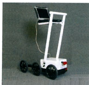
CS8800型 手推式断面仪 CS8800 Profiler