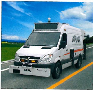
ARAN 4900型 多功能道路检测车 ARAN 4900 Multi Function Road Analyzer

To provide advanced and integrated monitoring solutions to enhance construction quality, to ensure road construction quality, comfort and safety for travelling. As a result, the overall construction and maintenance cost for highway construction will be minimized.