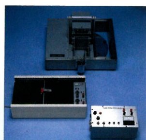
DF型 动态摩擦系数测定仪 DF Dynamic Friction Tester