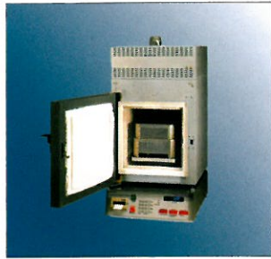
NCAT燃烧法沥青含量测定仪 NCAT Asphalt Content Furnace