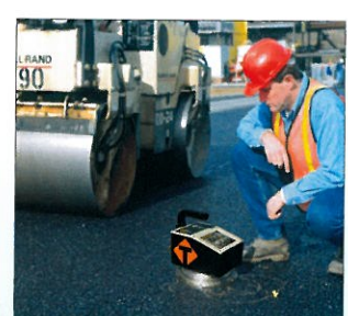
PQI380 型无核法沥青 路面密度测定仪 PQI 380 Pavement Quality Indicator