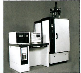
CS 7400-UCB型 Superpave剪切试验机 CS 7400-UCB Superpave Shear Testing System