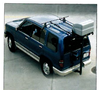
PPS-2005型 路面轮廓扫描车 PPS-2005 Pavement Profile Scanner