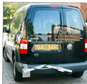
Laserprof 型 高速激光 路面平整度仪 Laserprof Profilograph