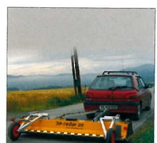
3D RADAR 探地雷达 3D RADAR System