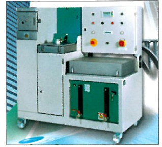
20-1120/20-1100型 自动沥青抽提仪 20-112-/21100 Automatic Binder Extraction Machine