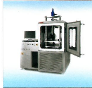
CRT-HYD25-II 型沥青 混合料伺服液压试验系统 CRT-HYD26-11 Hydraulic Pressure Testing System