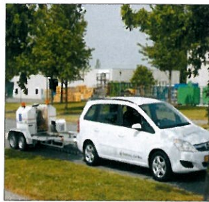
PRIMA-X 型 落锤弯沉仪 PRIMA-X Falling Weight Deflectometer