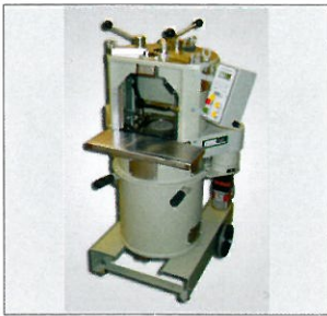
AFG2CS型 旋转压实仪 AFG2CS Gyrotory Compactor

By introducing the method of EME and the latest technology Strategic Highway Research Program (SHRP) from the US, the technical level of asphalt and asphalt mixture materials testing can be improved.