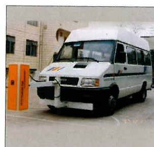
IRIS 型 路面雷达检测系统 IRIS Integrated Radar Inspection System