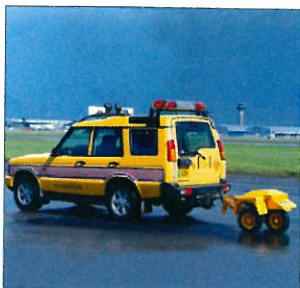
MK6型 横向路面摩擦系数测定仪 MK6 Highway/ Runway Friction Tester