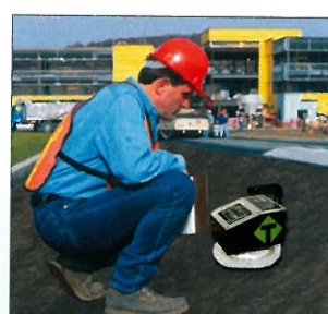
SDG200 型土壤密度仪 SDG200 Soil Density Gauge