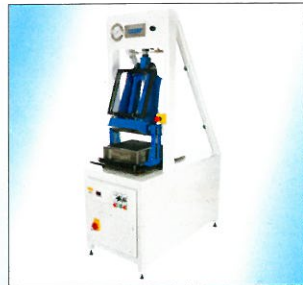
CRT-RC-H 液压标准轮碾压实机 CRT-RC-H The Hydraulic Standard Roller Compactor